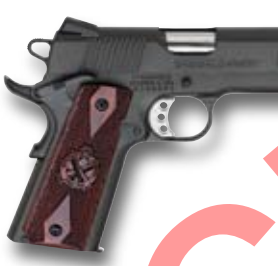
Loaded Full Size Stainless Steel 9x19 mm (PX9130LP)