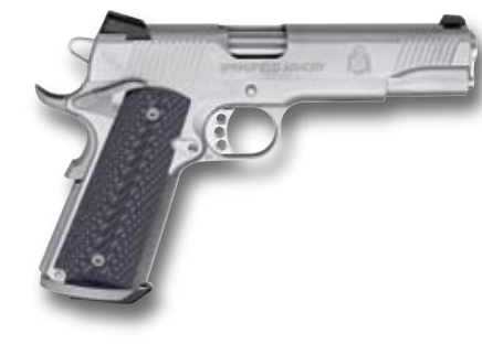
Trophy Match (PI9140LP)