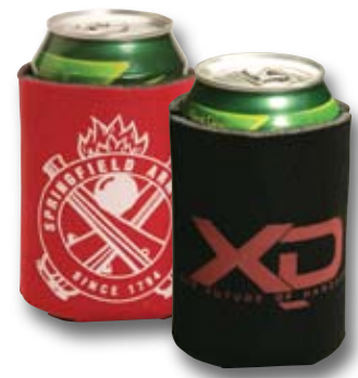
CAN COOLIES: Springfield Pocket Coolie, Red GE5501 XD Pocket Coolie, Black GE5498