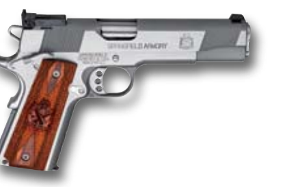
Loaded Black Stainless Target (PX9152LP)